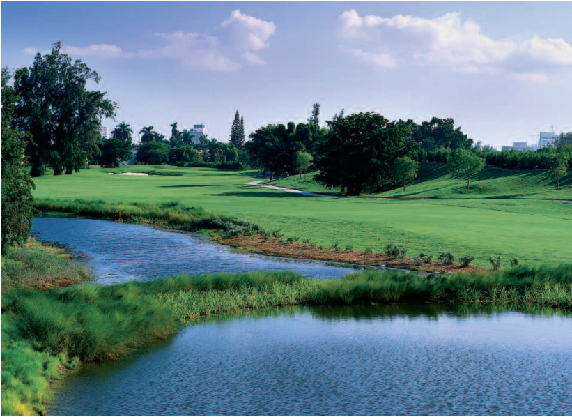
A $10 million renovation and re-design created today's engaging layout.