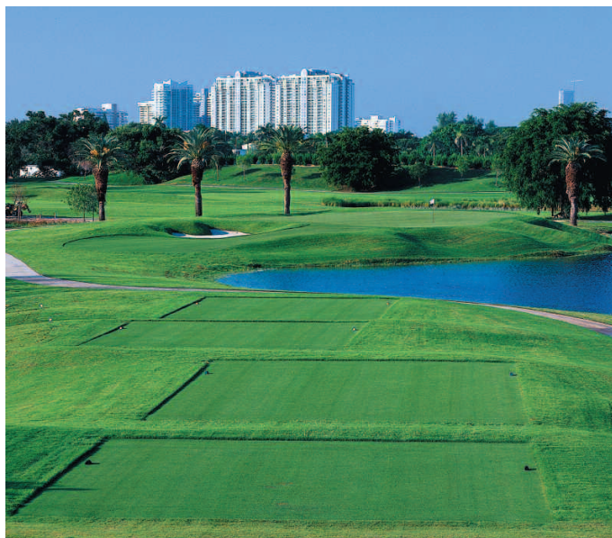
Water plays on 14 of Miami Beach Golf Club's 18 holes.

The course plays from five sets of tees, measuring 6813 yards